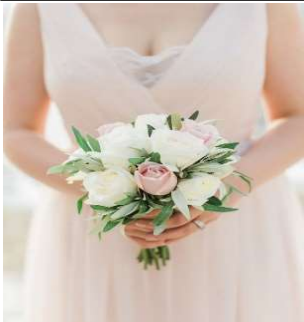
Bridesmaid Bouquet 50€