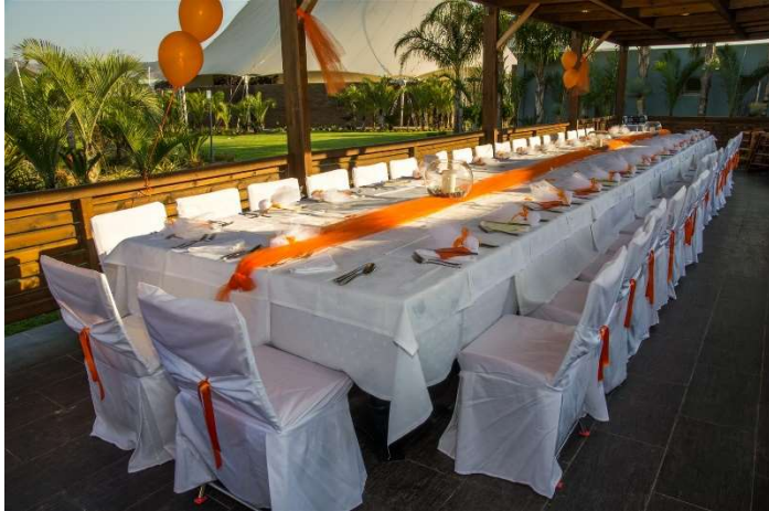
Boardroom Style up to 18 guests