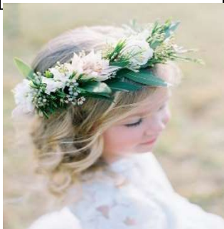
Flower Girl Hair 25€