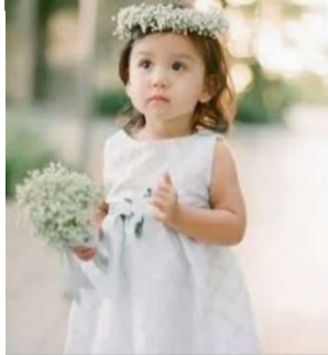
Flower Girl Bouquet 25€