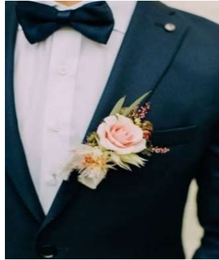
Buttonhole Special 20€