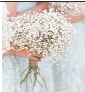
Bridesmaid Bouquet with gypsophila 40€