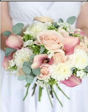
Upgraded Bridal Bouquet with roses 80€