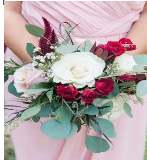
Bridesmaid Bouquet Special 70€