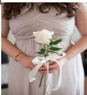
Single Stem Rose 15€