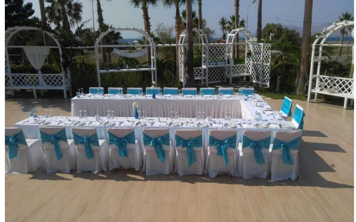
U-shape up to 30 guests