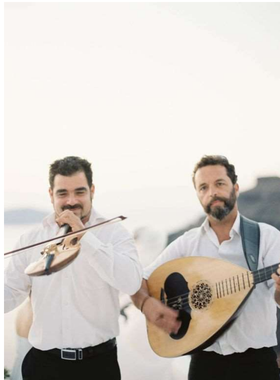
Bridal Band 450€