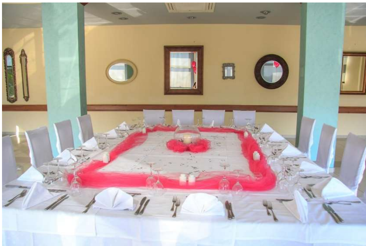
Hollow Square style up to 20 guests