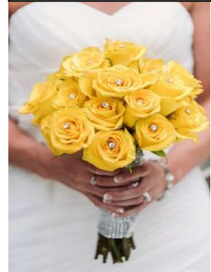
Upgraded Bridal Bouquet with crystal 95€