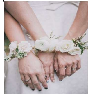
Bridesmaid Wrist Corsage 30€